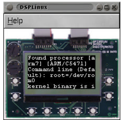
Keypad/Display Device in the Appliance Simulator

Tapping into the large pool of publicly available Open Source code is among the benefits of building your device using embedded Linux. We included several useful Open Source packages for Internet-connected devices with these BSPs. Look for more useful Open Source packages on the DSPLinux.net website in the future.