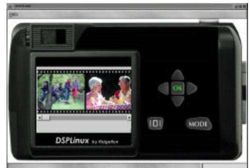
Digital Camera in the Appliance Simulator

The industry standard GNU software development tool suite is part of this BSP. These tools are configured for cross-compilation, allowing you to develop code for targets supported by DSPLinux.